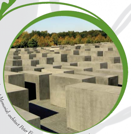
Holocaust Memorial, architect Peter Eisenman & engineer Buro Happold